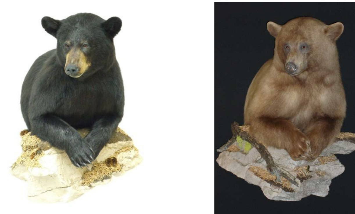
Front Half Bear Form # 111$315.00The current price for above bear mount is $1985.00.Dimensions: 4 5/8" X 17 1/2" X 36 1/2" E-N X Neck X Chest